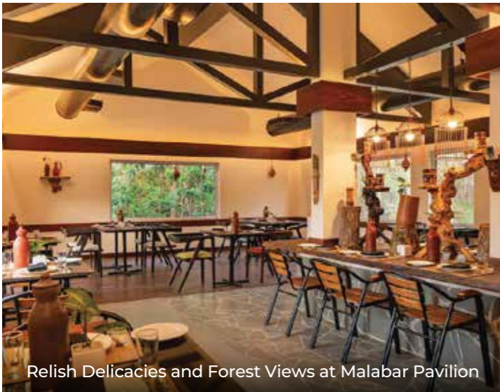
Relish Delicacies and Forest Views at Malabar Pavilion

A beautiful resort at the edge of the Muthanga Wildlife Sanctuary, this retreat showcases the wilderness of Wayanad. Stay in rooms inspired by the surrounding landscapes, embark on wildlife safaris and let the earthy flavours of Kerala awaken your senses.