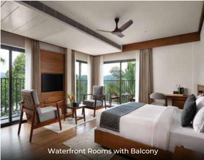
Waterfront Rooms with Balcony