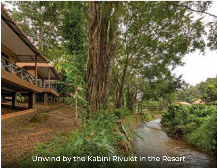
Unwind by the Kabini Rivulet in the Resort

Hidden in a lush forest by the Kabini rivulet, this retreat features stilted cottages that blend seamlessly with nature. Explore the unspoiled wilderness on guided treks, spot exotic wildlife and experience the charm of slow living with authentic local cuisine.