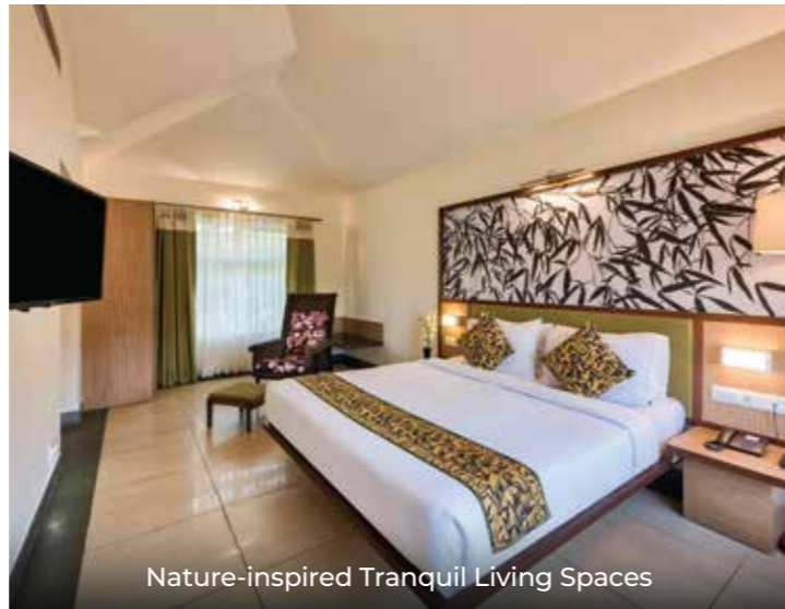
Nature-inspired Tranquil Living Spaces