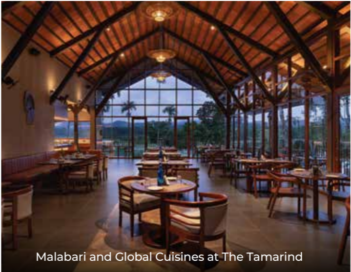
Malabari and Global Cuisines at The Tamarind

Nestled beside the tranquil Karapuzha Reservoir, this retreat is a haven for nature enthusiasts. Wake up to mesmerizing views of Cheengeri Hills, dive into the infinity pool, and indulge in Malabari dishes that reflect the region's vibrant culinary heritage.