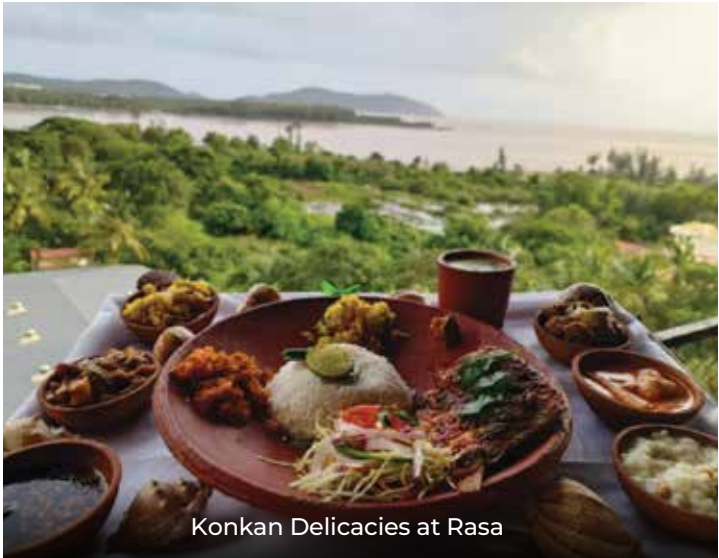
Konkan Delicacies at Rasa