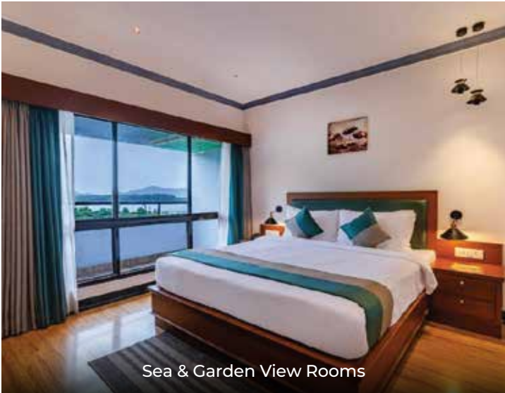
Sea & Garden View Rooms