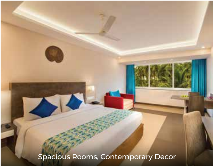
Spacious Rooms, Contemporary Decor