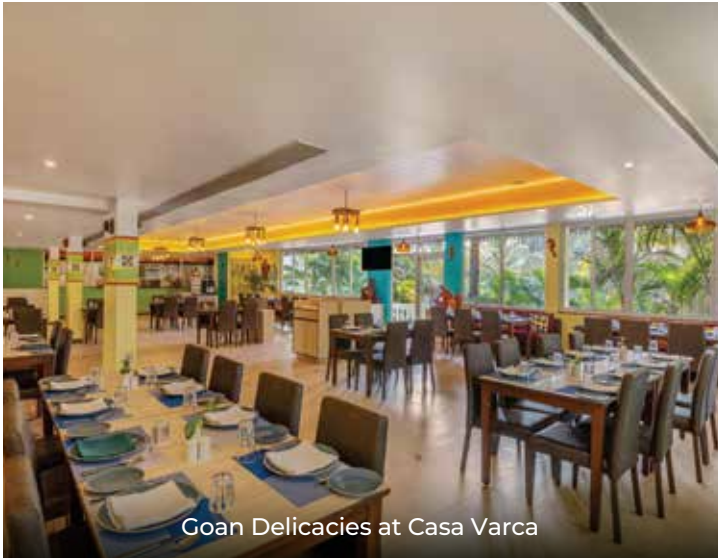
Goan Delicacies at Casa Varcas

A vibrant escape near Varcas and Colva beaches, this retreat captures the essence of Goas lively spirit. Spacious rooms with garden views, coastal delicacies and proximity to Goas buzzing nightlife make it an ideal getaway.