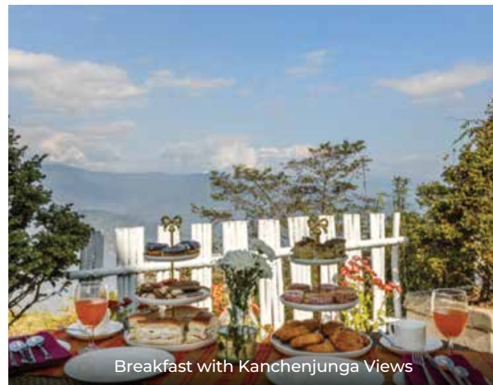
Breakfast with Kanchenjunga Views