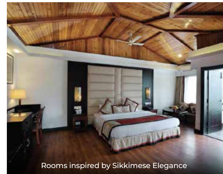
Rooms inspired by Sikkimese Elegance