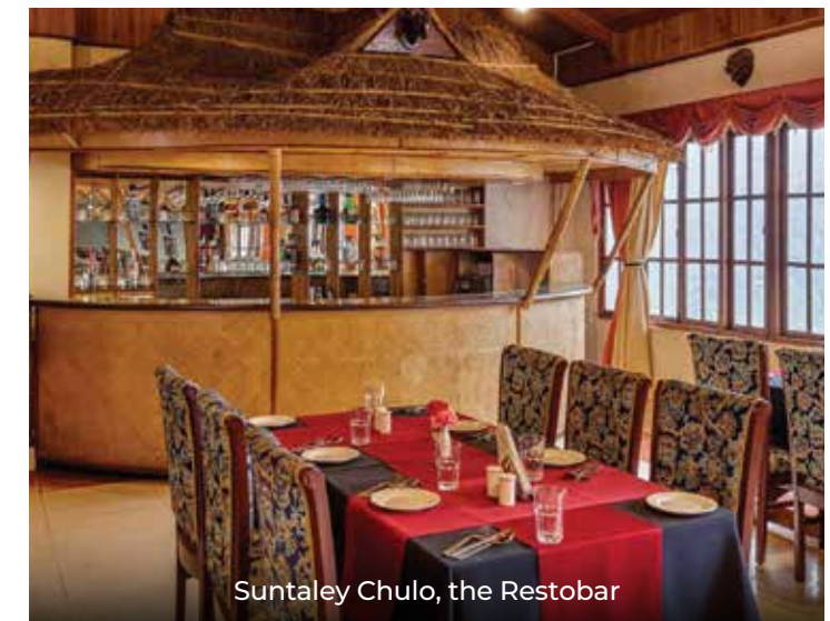
Suntaley Chulo, the Restobar