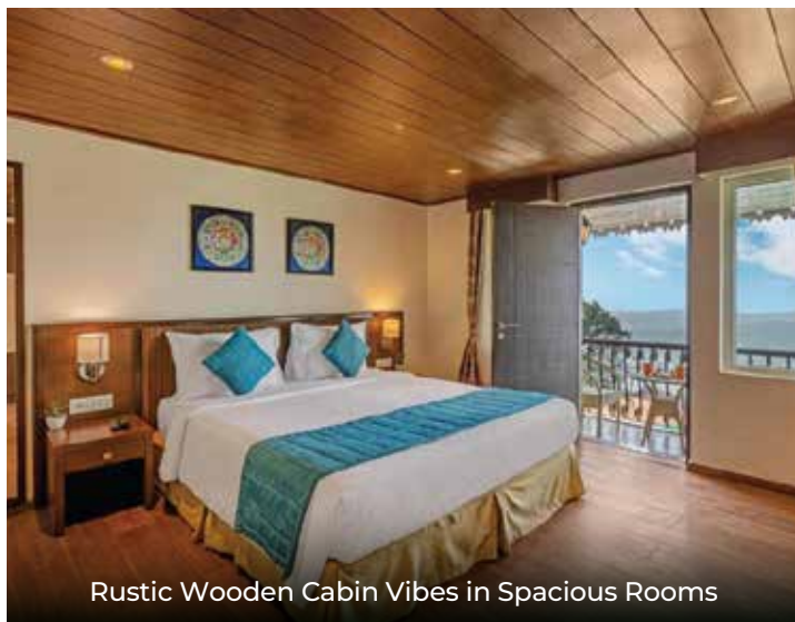
Rustic Wooden Cabin Vibes in Spacious Rooms

A serene getaway with breathtaking views of the Rani Khola River and the surrounding hills. Traditional Sikkimese touches blend seamlessly with warm interiors, while private balconies, local flavours and wellness treatments create an unforgettable Himalayan retreat.